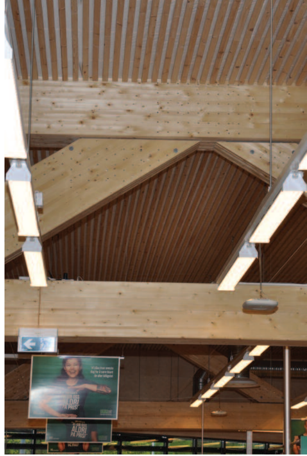
Wood used in food stores.

Regional Research Funds (RFF) in Norway is a funding mechanism for regional research. The RFF of the Innlandet Region has funded a project for smart measurements for process control at sawmills using x-rays. The goal is to develop new automatic methods for measuring wood moisture and smart utilisation of the data for a